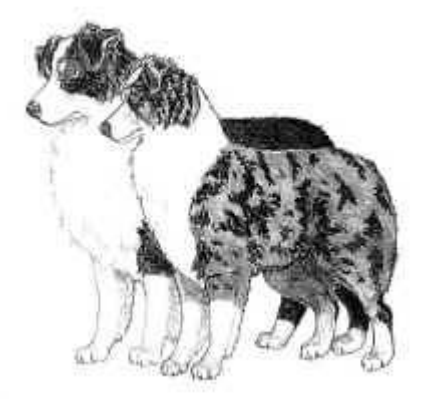
Merle bitch with Tri dog in background. Trim color is optional and not to be preferred

GENERAL APPEARANCE: The Miniature Australian Shepherd is a well-balanced herding dog of small to medium size. Bone is also moderate and in proportion to body size. He is attentive and animated, showing strength and stamina combined with unusual agility. Slightly longer than tall, he has a coat of moderate length and coarseness with coloring that offers variety and individuality in each specimen. An identifying characteristic is his natural or docked bobtail. In each sex, masculinity or femininity is well defined. Disqualifications: Toy like features (i.e. domed head, bulging eyes, fine bone)